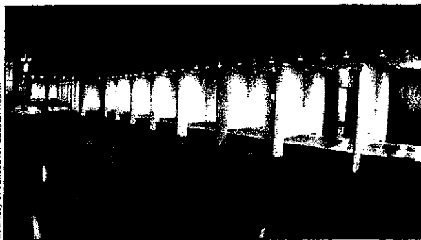
Fig. 1: Vancouver's medically supervised safer injecting facility.

Although the best strategy for evaluating the safer injecting facility would be to randomly assign IDUs to either full access or no access to the program, interventional study designs for the evaluation of such facilities have been deemed unethical; 15 thus, the evaluation of the Vancouver facility was structured primarily around prospective cohort studies involving IDUs who used the facility and those who did not. In accordance with the Transparent Reporting of Evaluations with Nonrandomized Designs (TREND) criteria for observational research, 16 a detailed description of the evaluation